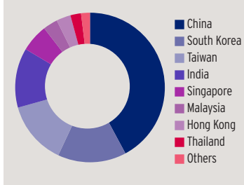
Geographical weightings of the fund in %*