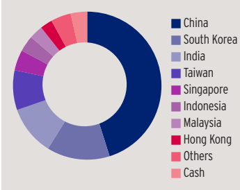
Geographical weightings of the fund in %*