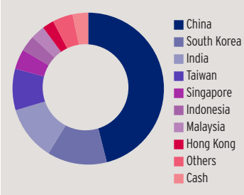
Geographical weightings of the fund in %*